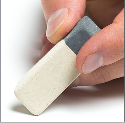
Left : HP Grade designation G½. Right : Grade used to add cutting power to eraser products.