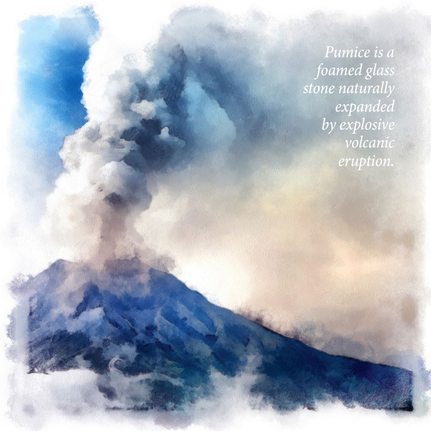
Pumice is a foamed glass stone naturally expanded by explosive volcanic eruption.