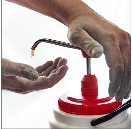
Left : HP Grade number 0-3/4. Right : Grade used in waterless grime-cutting soaps and gels.